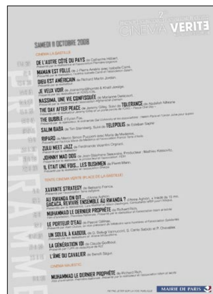
Flyer Paris 2008