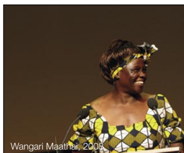
Wangari Maathai, 2008