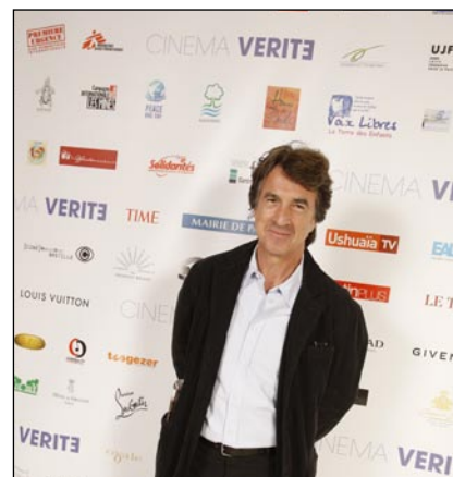
Photocall. François Cluzet, Paris 2008