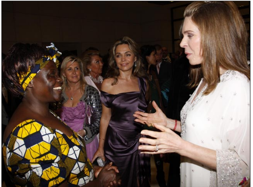
Wangari Maataï, H.M. Queen Noor, Madame Bob Geldof

All accounts are signed by an expert, and are at the availability of the partners.